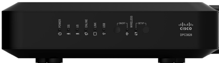
Figure 1. Example of Cisco Residential Wireless Gateway Model DPC3828

The Cisco DPC3828 integrated router features a Dynamic Host Configuration Protocol (DHCP) server, Network Address Translation (NAT) and Network Address and Port Translation (NAPT), and a Stateful Packet Inspection (SPI) firewall. These features allow the user to share a single high-speed public Internet connection as well as share files and folders between devices in the home network by attaching multiple wired and wireless devices in the active home or office to the wireless residential gateway.