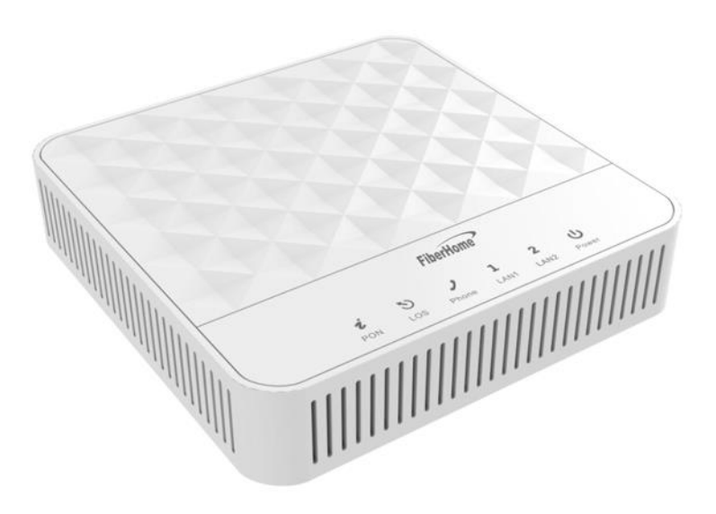
Figure 2-14 Overall Look of the AN5506-02-B

The overall look of the AN5506-02-B is shown in Figure 2-14.